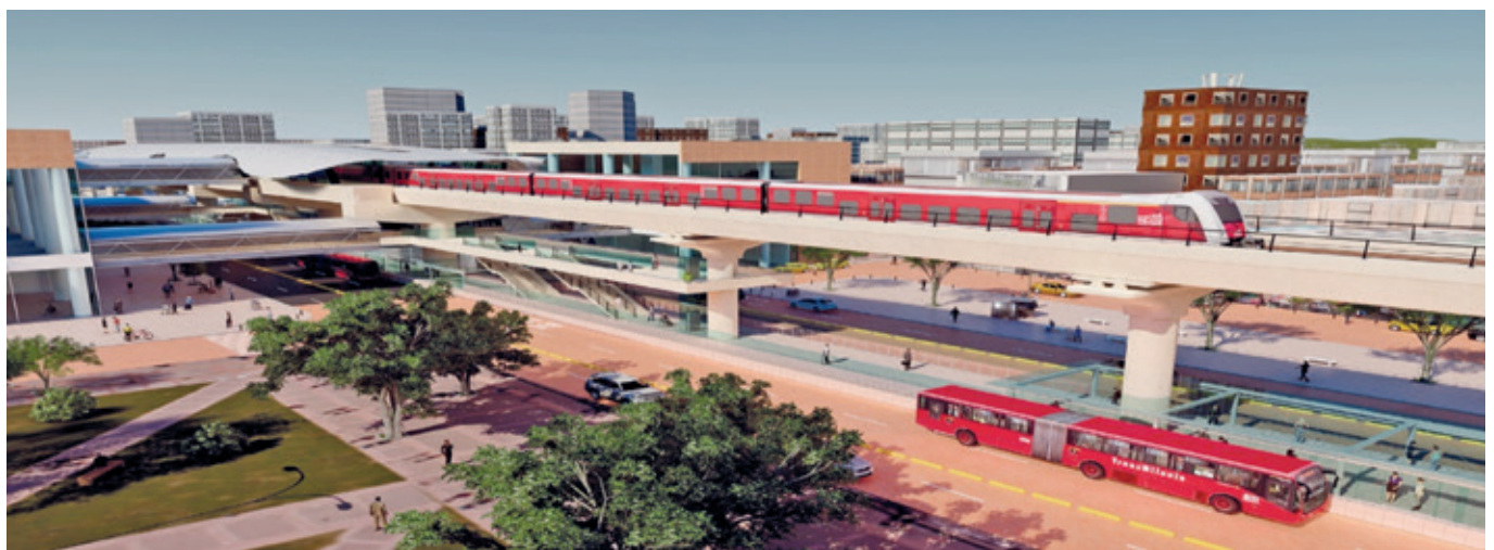
3D model of the new elevated metro line in Bogotá

through an ambitious modernisation programme. This involves refurbishing line D of the Buenos Aires metro, while improving environmental sustainability and optimising energy use.