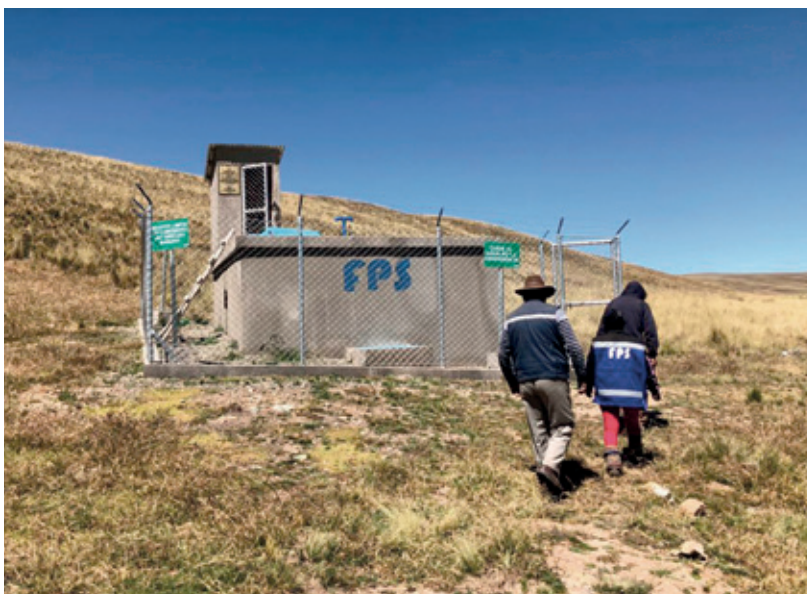
Clean water distribution facility in Waldo Ballivián, Bolivia

bring people closer together, while increased resilience ensures that extreme weather conditions do not undermine the economy. Key information and communication technology infrastructure contributes to services across all sectors, from local authorities, healthcare and education through to connecting businesses.