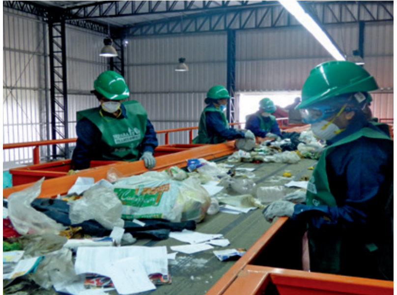
Recuperadoras in Jujuy's new urban waste management facilities

The Government of Jujuy Province, in Argentina, is implementing the integrated solid urban waste management plan co-financed by the EU through an EIB loan in the amount of EUR 38 million and a EUR 11 million grant from the Latin America Investment Facility. Thanks to the EU support, a new bio-gas plant along with a collection and environmental centres are being built up. The project is also providing women working in Jujuy's landfill sites with the training needed to land a new job, helping them to improve their economic situation while reducing the possible risks faced when working in the rubbish dumps. These recuperadoras (female waste collectors) used to sort the 200,000 tonnes of waste reaching these open-air rubbish dumps with no selective treatment capacity.