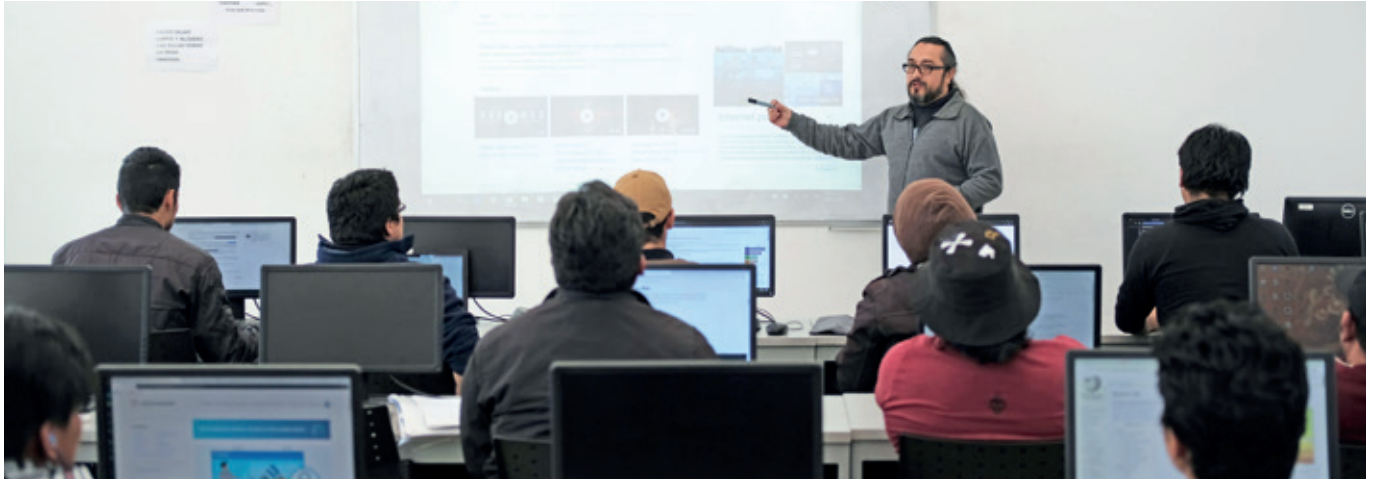
Technical and technological institute in Quito, Ecuador

In 2018, the EIB signed two agreements aimed at enabling swift progress in the construction of the technical and technological institutes. One concerns a EUR 11.6 million grant provided by the European Union's Latin America Investment Facility, and deployed by the EIB, to build a technological institute in Portoviejo.