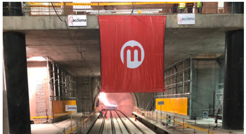
Construction of the metro in Quito

The people of Quito will be getting a new metro line, the first in the city, enabling 450,000 people to move through the capital every day. The new 22.5 km-long metro line, with its 15 stations, will be a milestone in the history of the city. The new line will help to ease traffic congestion in Ecuador's capital and in its suburbs, improving the efficiency of public transport while reducing fuel consumption and greenhouse gas emissions. The EIB's contribution to this project amounts to EUR 240 million.