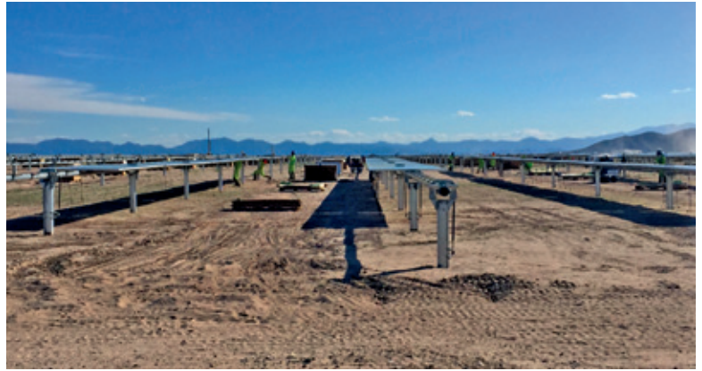
Villanueva solar plant located in the municipality of Viesca, Coahuila State

In Mexico, the EIB is financing the largest solar project ever built in the Americas. The EIB provided EUR 74 million to finance the construction of three new solar plants, located in the states of Guanajuato and Coahuila, with average annual energy production of 1.1 Gigawatt power (GWp). The project was selected in the first long-term renewable energy auction in Mexico and is contributing to the reduction of CO 2 emissions, while lowering wholesale electricity prices in the country. In addition, the EIB also supported the development of renewable energies in Mexico with an EUR 86 million credit line to NAFIN.