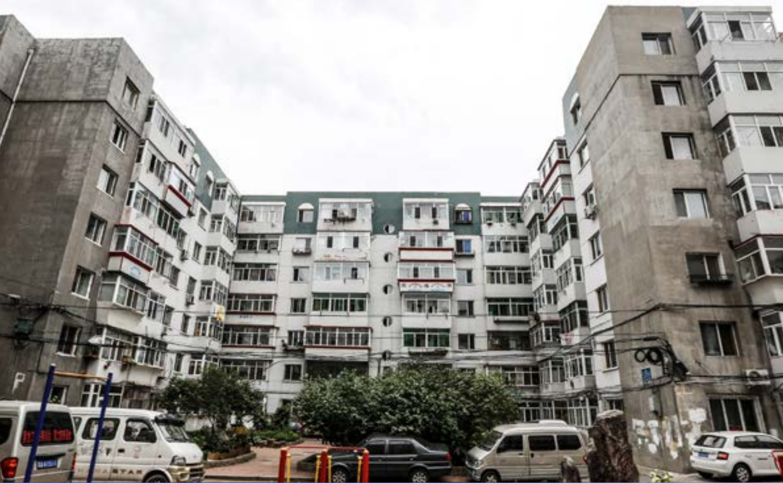
Building 37, Min'an Compound, Harbin, before and after the energy renovations.