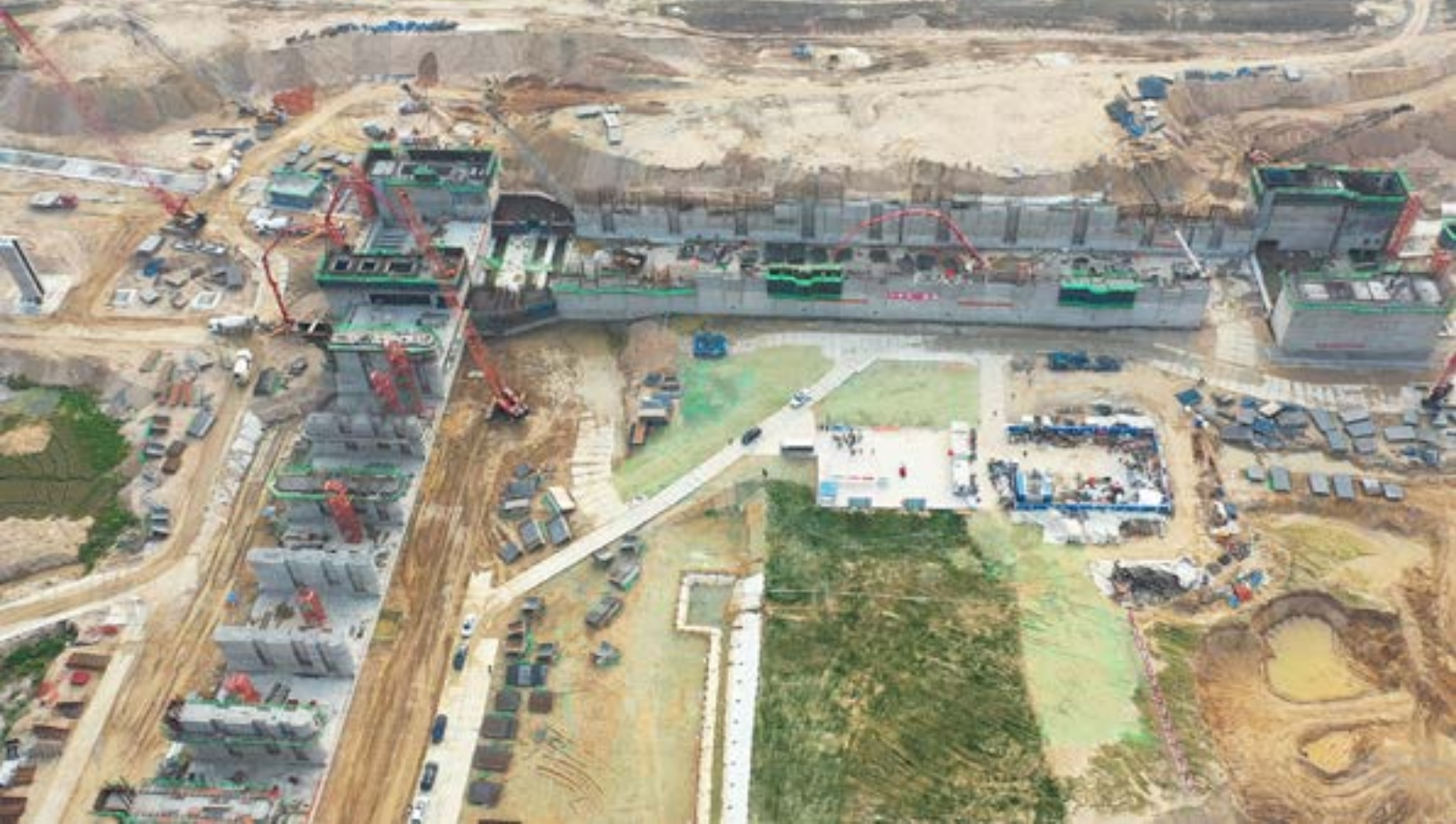
Construction of the first phase of the Jiangxi Xinjiang Bazizui Navigation Hydropower Hub.