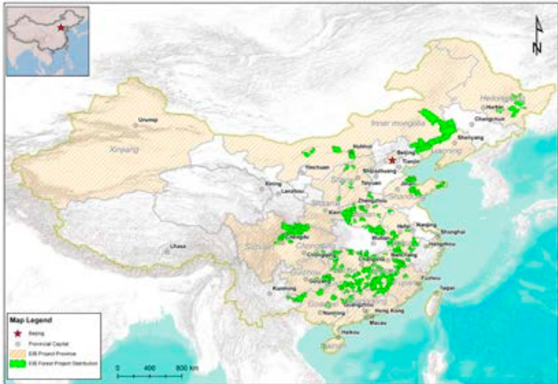
Chinese provinces with EIB projects, and distribution of forestry operations.