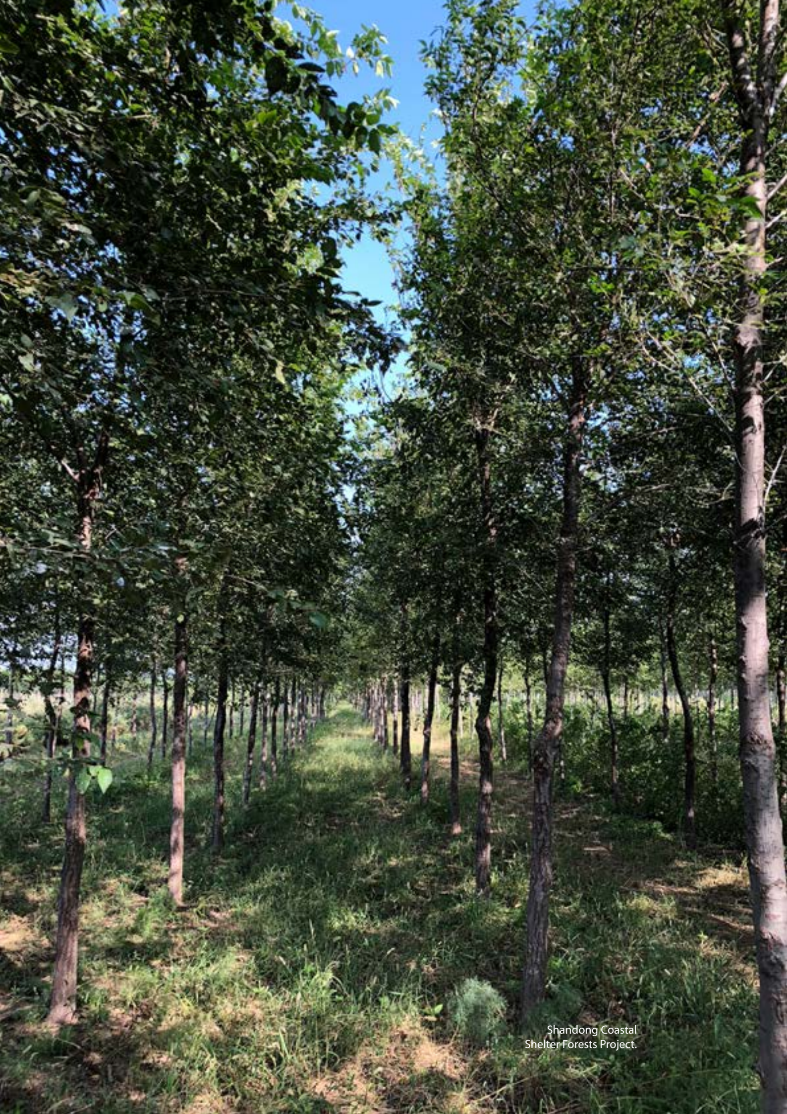
Shandong Coastal Shelter Forests Project.