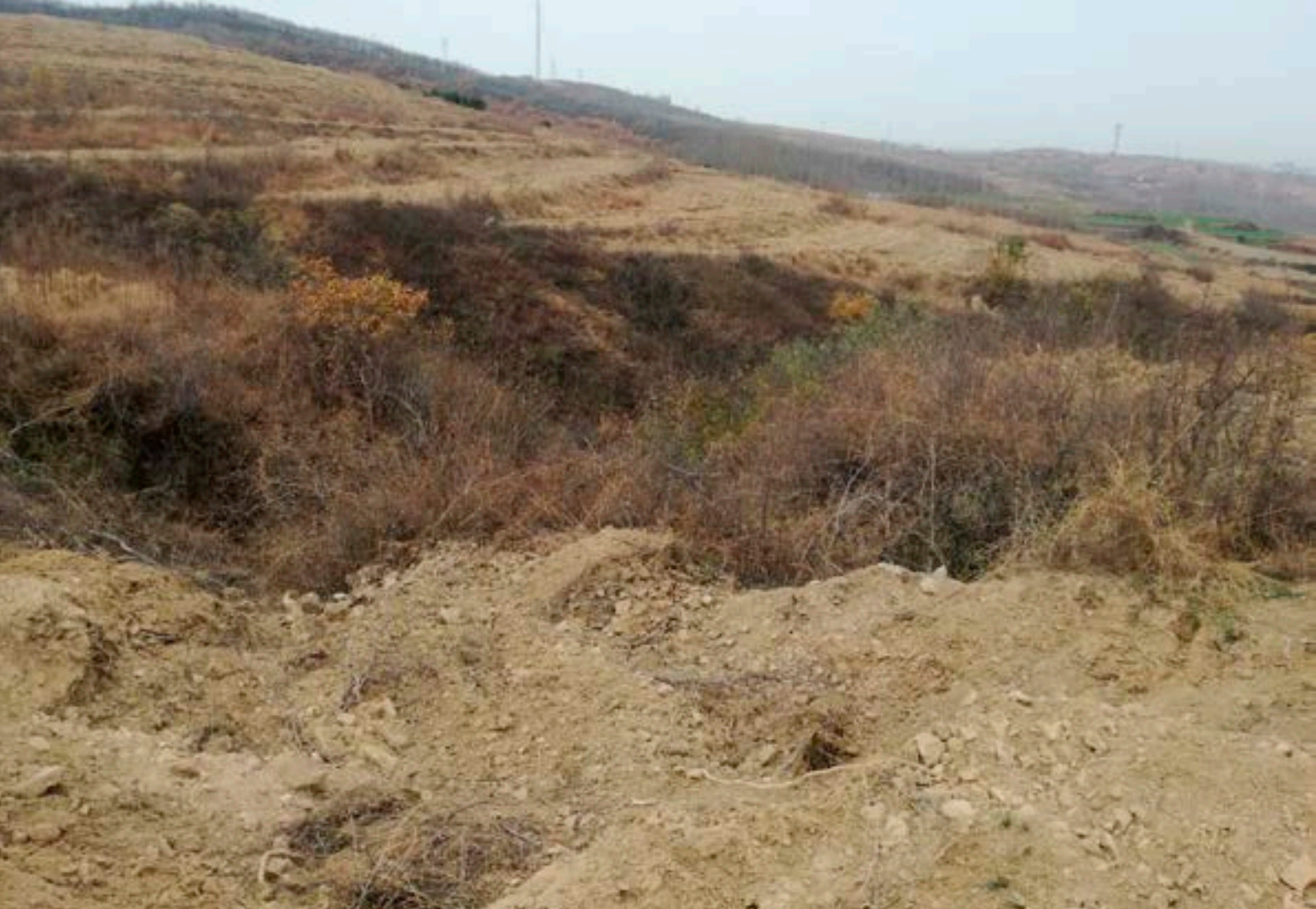
A before-and-after look at the forest rejuvenation programme in Zhucheng, Weifang, Shandong Province.