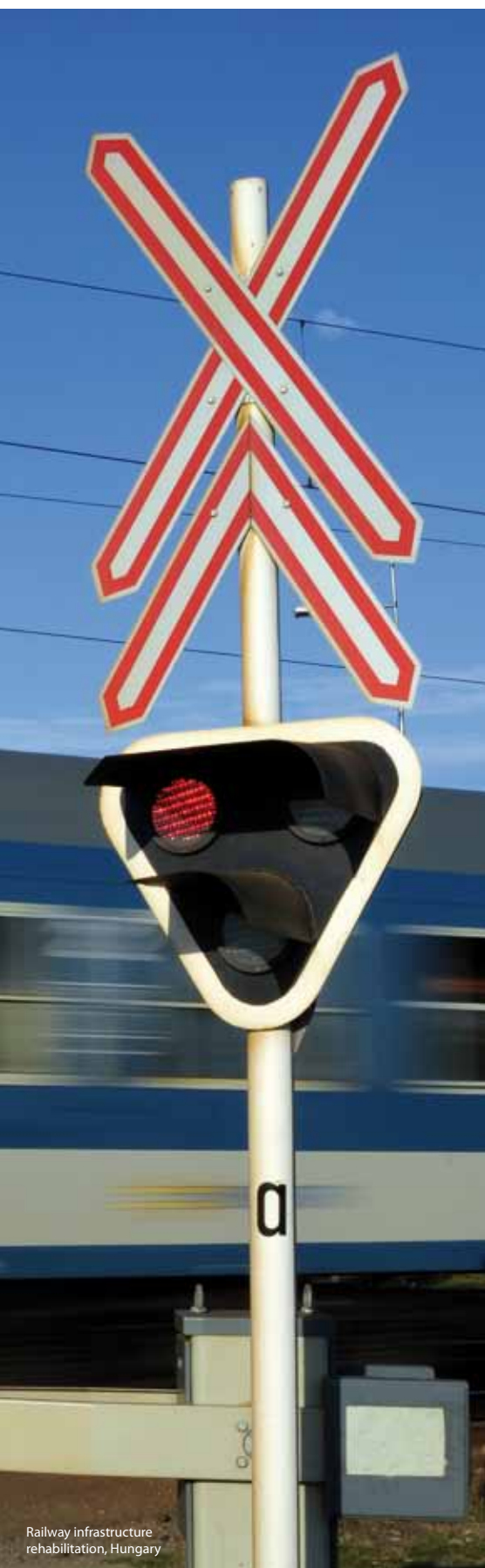
Railway infrastructure rehabilitation, Hungary