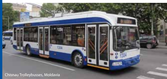
Chisinau Trolleybuses, Moldavia

In the Municipality of Chisinau, Moldova's capital, a EUR 10.3m EIB loan is helping to upgrade urban infrastructure. Six major streets are being overhauled, with new public lighting, traffic signals, parking facilities and water drainage being installed. The project is co-financed with the EBRD and technical assistance funds. Underpinning the EU Strategy for the Danube Region, the project follows on from the successful completion of the scheme to modernise the city's trolleybuses, which is also being financed by the EIB and the EBRD.