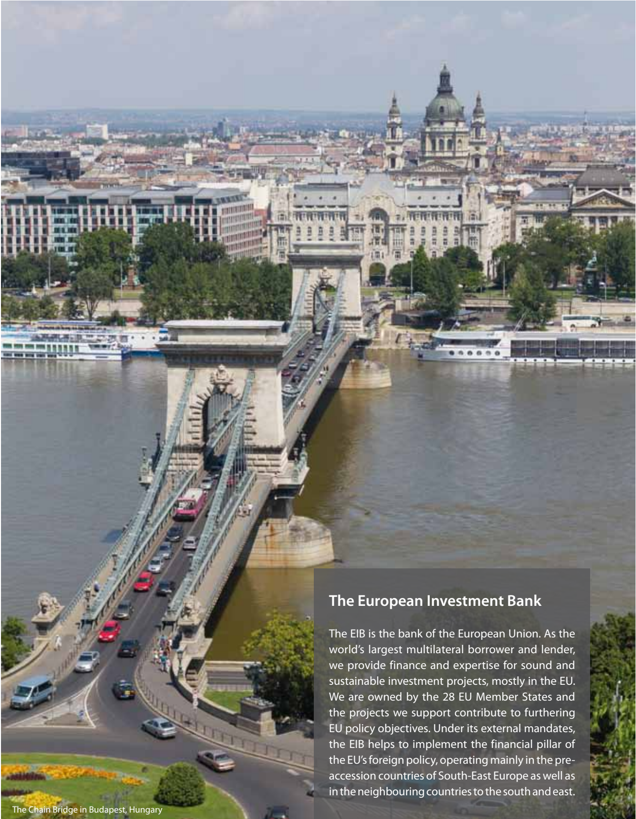
The Chain Bridge in Budapest, Hungary