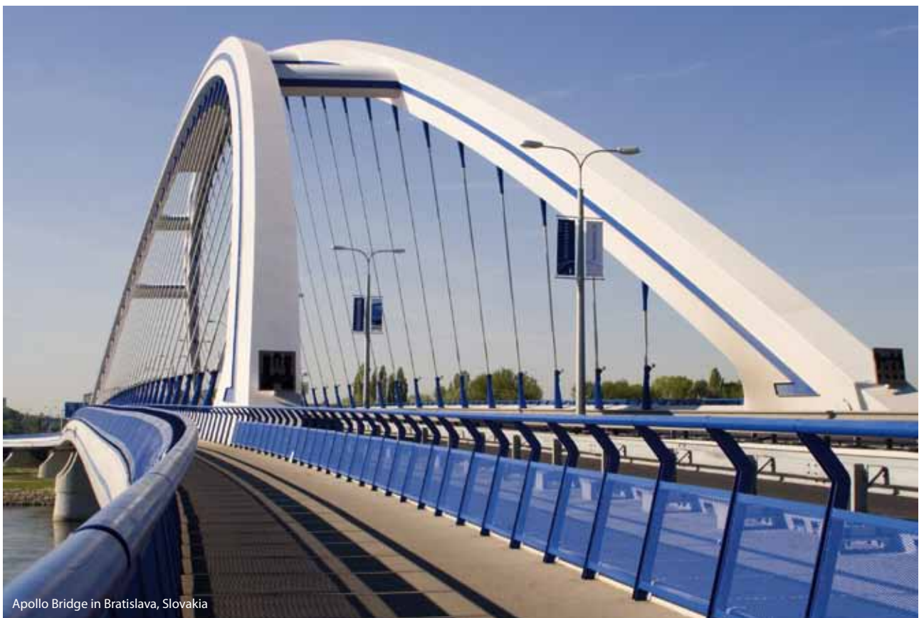
Apollo Bridge in Bratislava, Slovakia

The Danube Region is home to more than 115 million people. The Danube's catchment area is shared by nine EU Member States 1 and five non-EU countries 2 . The part of the region located within the European Union makes up one fifth of the EU's territory and the region's economy, competitiveness and well-being are intricately linked to those of the Union as a whole. For these reasons, the European Union has developed a macro-economic strategy to strengthen cross-border cooperation in the Danube Region. The EIB is fully supporting this strategy.