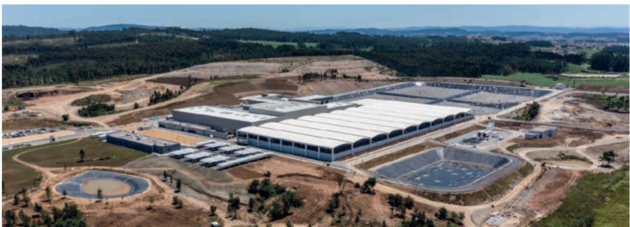
The Resulima Waste Recovery Unit.

2022 was also a year of key events for the EIB Group in Portugal. The EIB demonstrated its commitment to the water sector at the UN Ocean Conference in Lisbon. It highlighted its investments in the innovation sector at Web Summit and its focus on sustainability and resilience at the joint conference with the Lisbon School of Economics and Management (ISEG), under the patronage of the President of the Portuguese Republic.