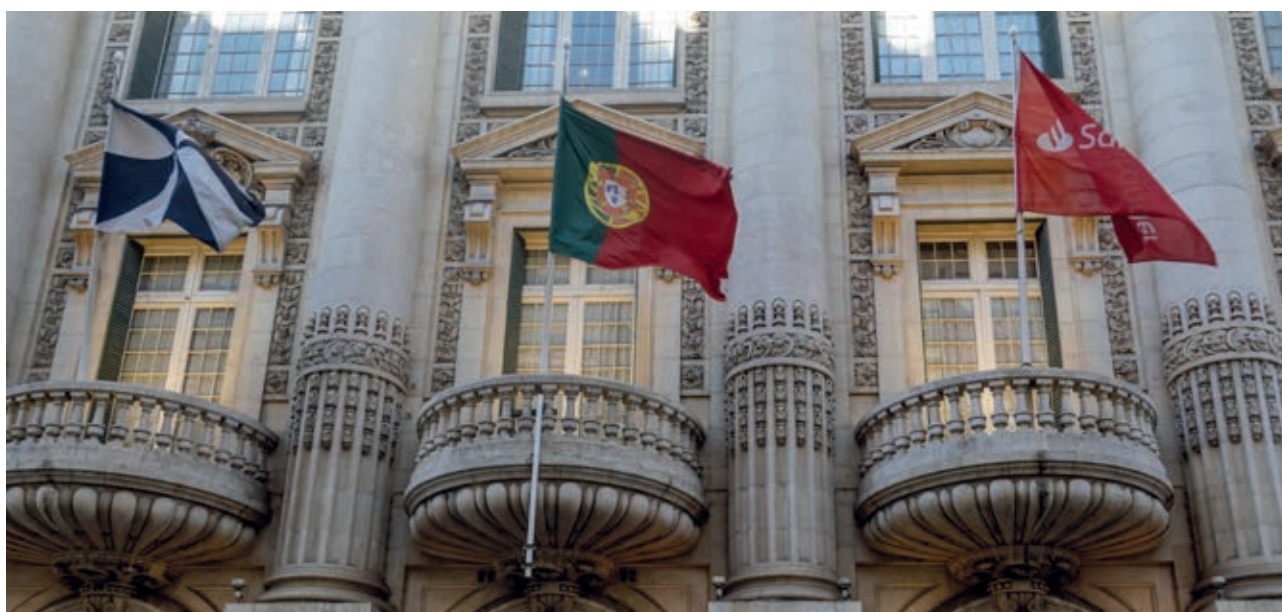
The EIB and Santander Portugal are providing €820 million for small and medium-sized Portuguese businesses.

The European Investment Bank and Banco Santander Portugal signed an agreement in 2022 to support small and medium enterprises and mid-caps in Portugal with a total investment package of €820 million. This agreement will provide more loans to these companies, especially those operating in less developed regions, supporting over 3 000 businesses. The EIB funds will be made available to Santander via a true-sale ABS structure (backed by a portfolio of consumer finance loans). The agreement increases the financing available to small and medium businesses and mid-caps as the economy recovers from the impact of the coronavirus pandemic, the high energy costs, and rising inflation stemming from macroeconomic impacts of the war in Ukraine that continues to put Portuguese companies under stress.