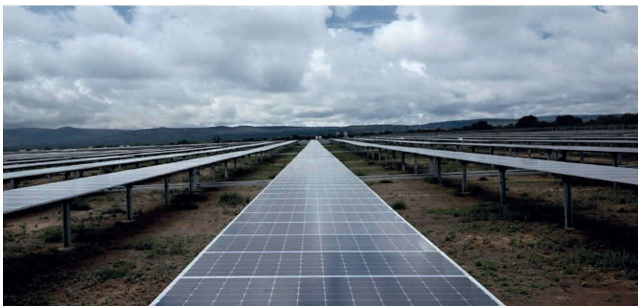
Iberdrola and the European Investment Bank sign a €70 million green loan agreement to boost renewable energy in Portugal

The financing will go to the following projects: Montechoro I and II (37 MWp), Alcochete I and II (46 MWp), Algeruz II (27 MWp), Conde (14 MWp) and Carregado (64 MWp). The financing will also include ancillary infrastructure such as access roads, substations and interconnections. The investments will boost economic growth and employment in these regions. Overall, the new infrastructure will create around 1 000 direct jobs during the construction phase, in addition to those generated in the wider supply chain.