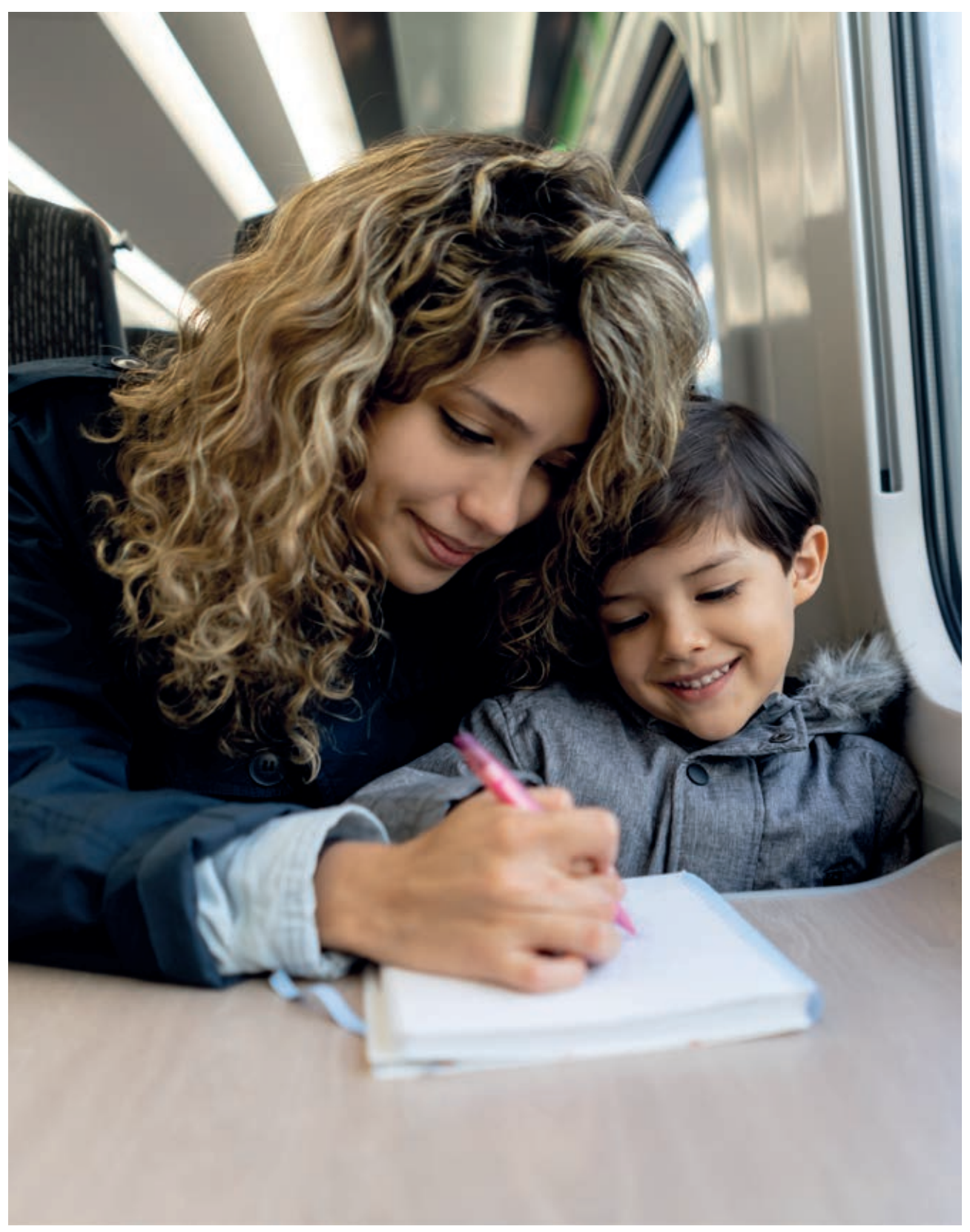
Boosting transport solutions for women in Spain.