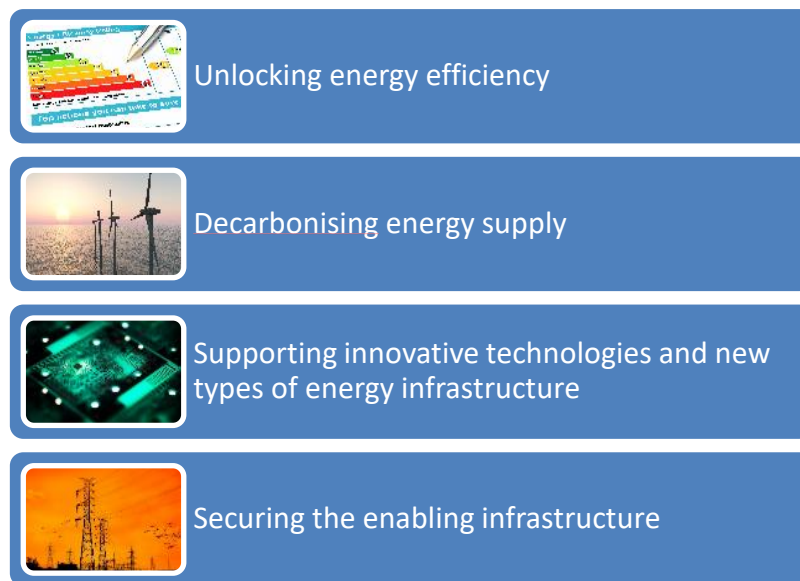
Figure 1: Themes of the energy lending policy