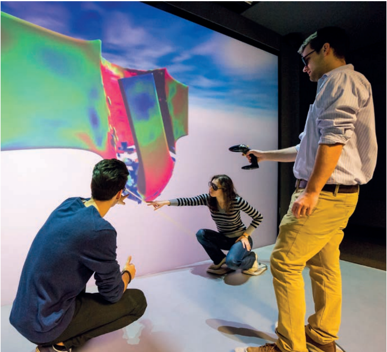
Virtual reality lab, Bulgaria.