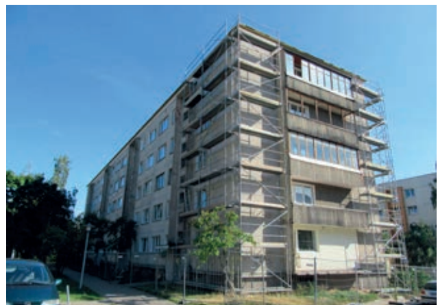
Improving residential energy efficiency, Lithuania.