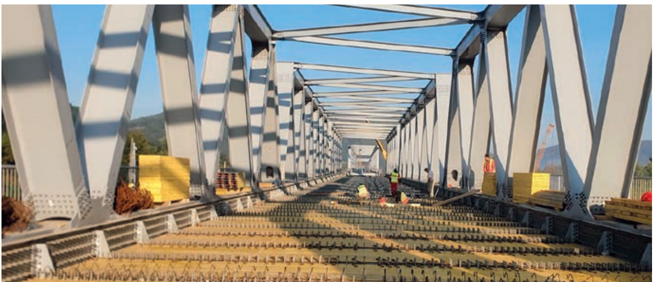
Rehabilitation of the Simeria railway line, Romania.

Since 2007, the Bank has complemented these EU funds with over €31 billion in structural programme loans, primarily in the east and south of the European Union. Moreover, the EIB Group has pioneered the implementation of financial instruments under shared management starting with JESSICA and JEREMIE during the 2007-2013 programming period and continuing with a wider thematic range in the 2014-2020 period. The EIB has managed nearly €3.4 billion on behalf of regional managing authorities, supporting some 3 600 projects in the period 2007-2020. The EIF has managed €1.1 billion in ESIF funds, leveraged to an aggregate portfolio of about €2.6 billion of SME financing supporting around 21 000 SMEs during the 2007-2013 period, and 60 500 in the 2014-2020 period. The EIB Group has thus established a unique market position thanks to its extensive experience and technical knowledge covering the entire financial instrument life cycle, from product design to implementation, management and financing.